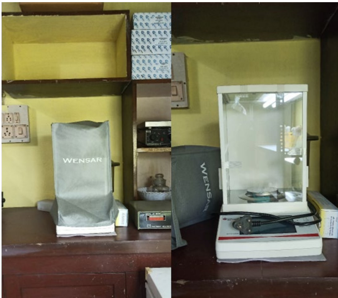
Instruments for research- Botany Department