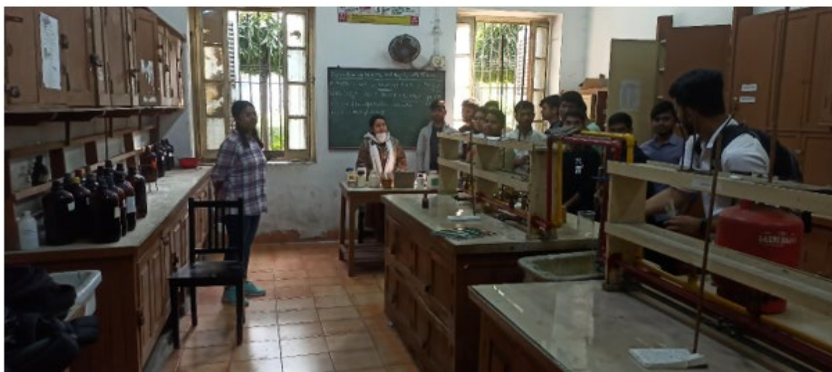
Research activities in Chemistry Department